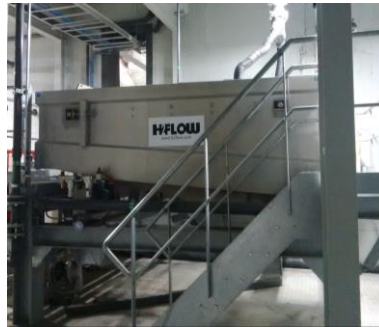
Dissolved Air Floatation units