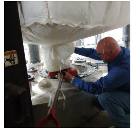
BIOWATER CMFF Bioreactor Units and Blowers